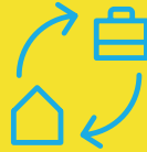
Mums who work out of home