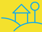
Mums who live in rural areas