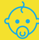
Mums with toddlers/pre-school children